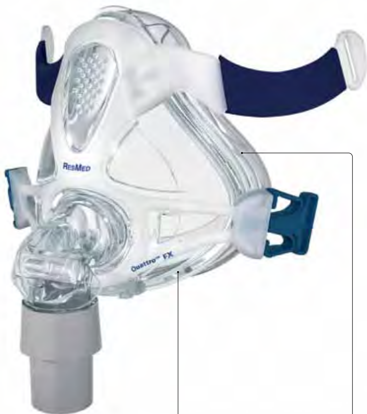
Frame system (no headgear) 61724 (S) 61725 (M) 61726 (L)

The Quattro FX provides ResMed quality and full face comfort in a lightweight, unobtrusive mask.