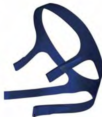
Headgear 61734 (S) 61733 (M) 61738 (L)