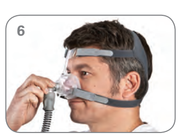
Attach the combined elbow assembly and air tubing to the mask by pressing the squeeze-tabs and pushing into