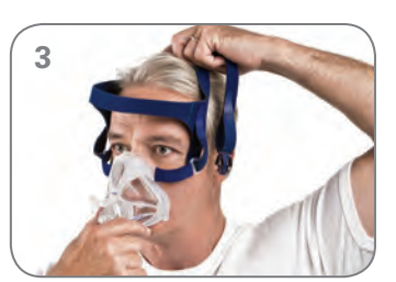
• Hold the mask firmly against the face and pull the headgear over the head.