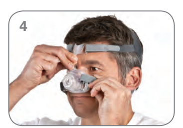
Bringing the lower straps below the ears, loop the headgear into the lower hooks on the mask