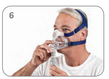
Connect one end of the air tubing to the swivel and the other end to the airflow device.